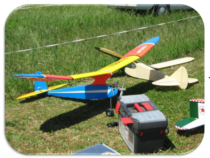
Tomboy #2 & 3